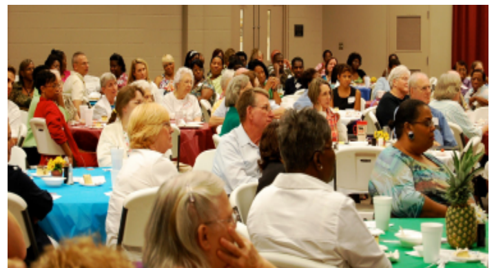
The 2010 agency conference attracted the largest crowd ever.