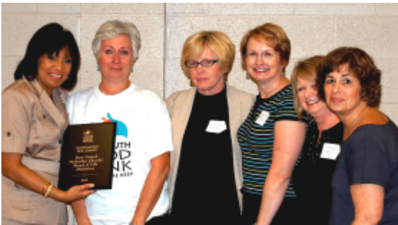
First United Methodist Church/Bread of Life Ministries in Covington, TN won Outstanding New Agency