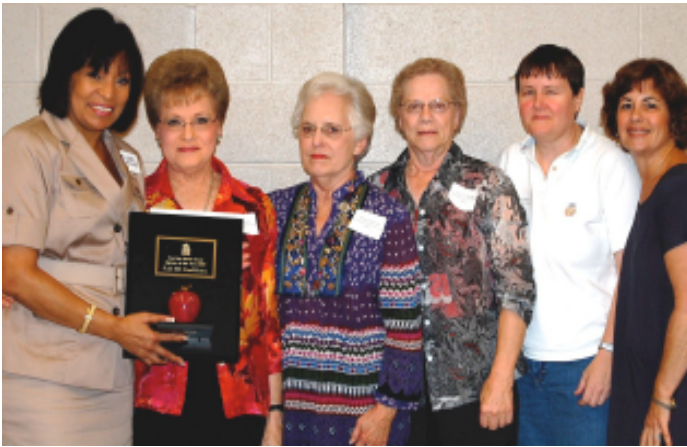
F.A.I.T.H. Food Pantry, Nettleton, MS won the Feed the Need award for Agency of the Year

Congratulations to all our award winners. In addition to the award plaques, winners also receive a gift certificate for $25 off their shared maintenance fees ($50 off for the Agency of the Year). So remember to nominate your agency next year!