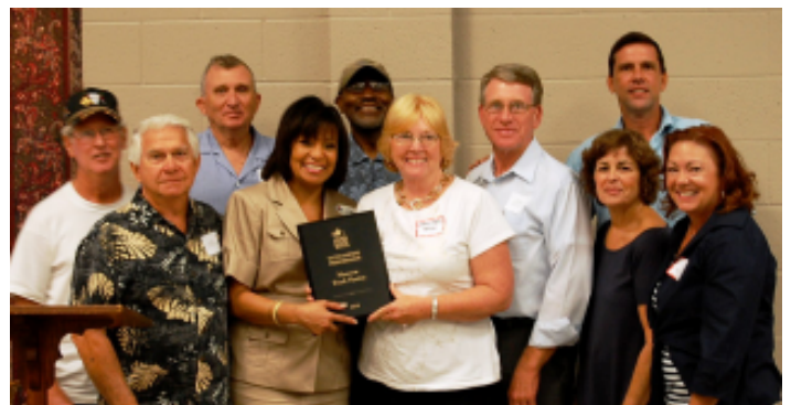
Moscow Community Food Pantry won the award for Outstanding Performance