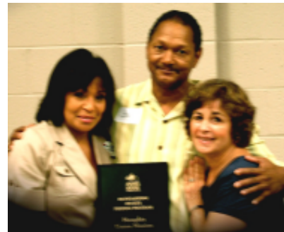
Memphis Union Mission was recognized at the Outstanding On-Site Feeding Program