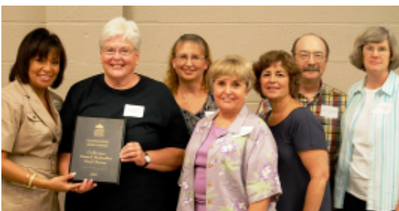
Coldwater United Methodist Church Pantry, Coldwater, MS, won the Outstanding Pantry award.