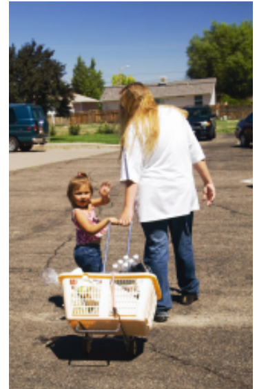
Wow! There's lots of food for me now!

Mid-South Food Bank realizes that our agencies are struggling to meet the increased need for wholesome food and other groceries. Therefore, the Food Bank board of directors has unanimously voted to reduce shared maintenance fees to a maximum of 7 cents a pound until the end of the year. (See special offer below for Shelby County only). Anything that is currently offered at less than 7 cents or no shared maintenance will remain at those levels. But for everything else - meat and other protein products, soups, vegetables, frozen items - everything is 7 cents per pound! You will see the changes on the shopping list starting November 1. The delivery fee of 3 cents per pound remains in effect.