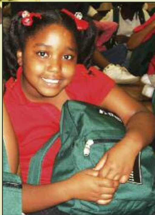
The Food for Kids Backpack Program at Girls Inc.

In Shelby County, nearly 61,000 children live in food insecure households. That means at some time during the last year, there was not enough food to feed the family. I have heard stories of children who eat popcorn for dinner or have no dinner at all, and as a community leader and caring adult, I feel it is my duty to help these children. The consequences of childhood hunger can be devastating: lower performance in school; higher incidence of behavioral problems. A hungry child cannot learn. The actual brain architecture of young children is adversely affected by not having enough food and by not having food that is healthy. Their immune system is compromised, making them more susceptible to viruses and other illnesses.