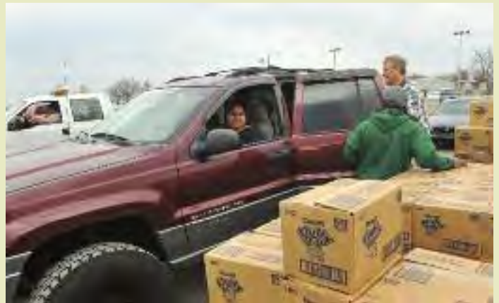
Mobile Pantry distribution is more than 2 million pounds of food and groceries.