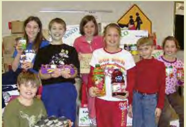
Kids Kan, the school food drive, had 145 participating schools in 2011.