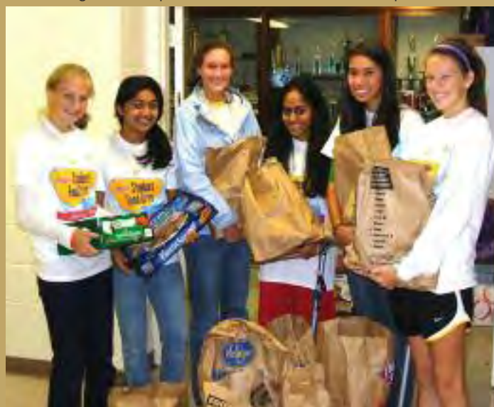
St. Mary's Episcopal School shows their support for the Student Food Drive, which began in 2007.

Community awareness is vital to any nonprofit organization and Mid-South Food Bank is privileged to have an outstanding history of working with the professionals in broadcast and print media