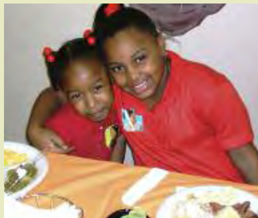
Kids Cafes serve more than 500 children every week.