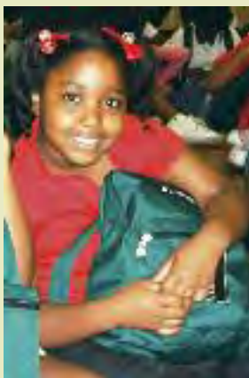
Kids love their Food for Kids backpacks.

The Food Bank started its first Food for Kids Backpack Program, another Second Harvest program, in 2006. Children who are eligible for free or reduced-price school meals receive a backpack filled with wholesome food to take home every weekend. The first program was at the Boys & Girls Club in Sardis, Mississippi.